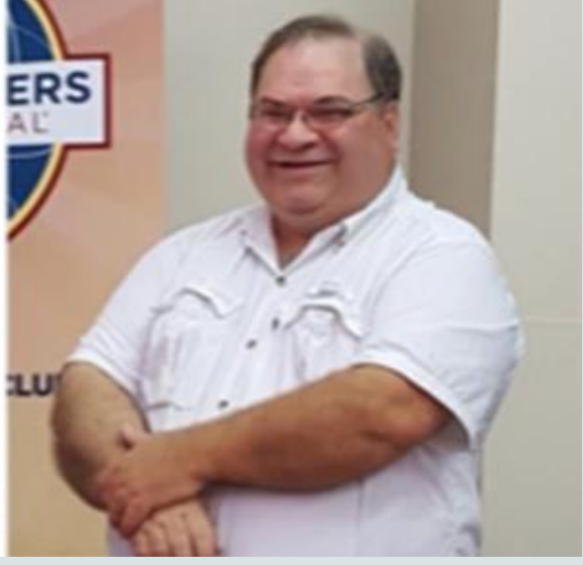
Unity Toastmasters Master Evaluators